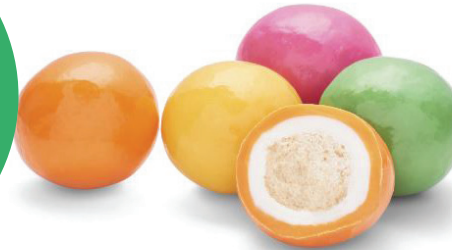
6962 ICE CREAM MALTED MILK BALLS Cool off with our Ice Cream Sundae Malted Milk Balls: a fun mix of orange sherbet, pineapple, key lime, and raspberry Cello Bagged. (5oz 140g bag) $12.00