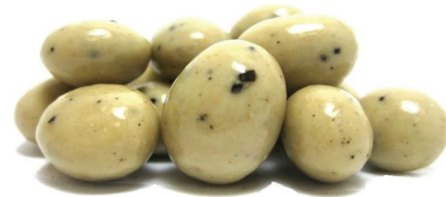
5233 GOURMET COFFEE AND CREME ESPRESSO BEANS AMANDES GOURMANDES Whole handpicked estate coffee beans dipped in creamy couviture then rolled and speckled with ground coffee. (100g bag) $12.00