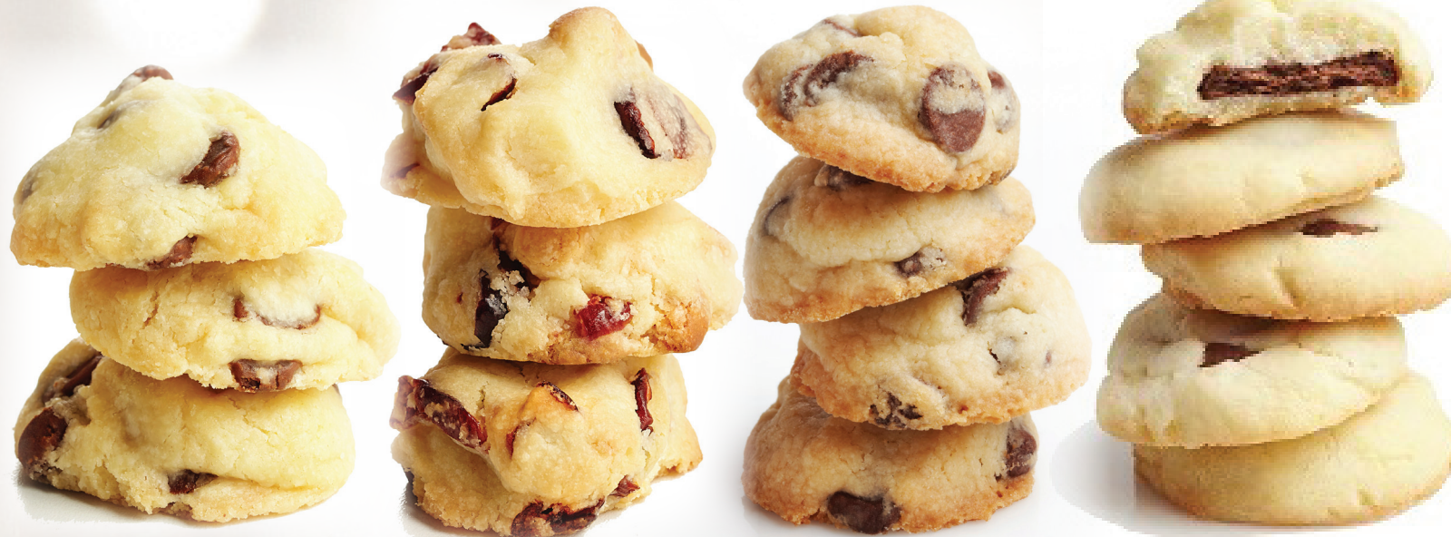
5010 Chocolate Shortbread Original These irresistible cookies combine melt-in-your-mouth shortbread filled with delicious fudgy chocolate. 170g. $14.00