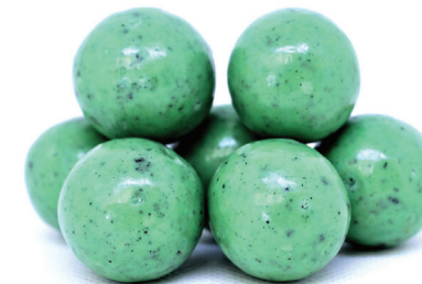
5501 MINT COOKIE MALT BALLS Boules maltées de biscuits à la menthe This best-selling treat blends real chocolate cookie pieces into a delicious minty green couviture (5oz 140g bag) $12.00