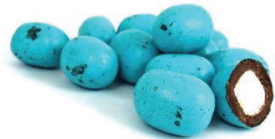
5424 GOURMET ROBINS MARSHMALLOW EGGS Real mini marshmallows drenched in pure milk chocolate then coated with a thin candy sugar shell simply sing "Springtime!" Cello Bagged. (5oz 140 gr. bag) $12.00