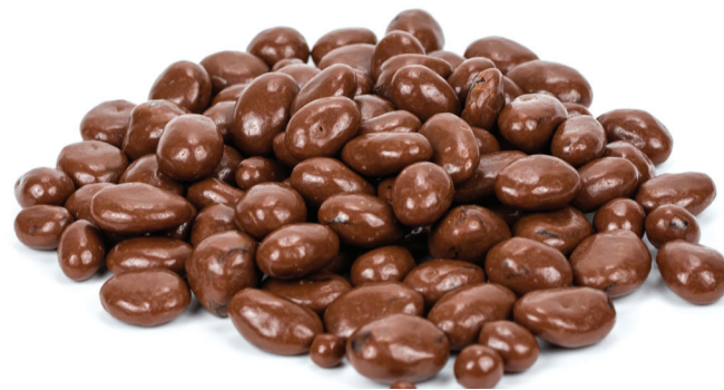
5406 CHOCOLATE COVERED RAISINS RAISINS SECS ENROBÉS DE CHOCOLAT AU LAIT Soft and succulent raisins coated in mouth watering milk chocolate. (140g bag) $8.00