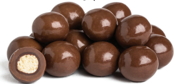
5502 MILK CHOCOLATE MALT BALLS Boules gourmandes de lait malté The eternal classic, creamy milk chocolate coats a giant malted milk balls center. (5oz 140g bag) $12.00