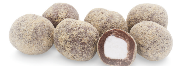
5513 GOURMET SMORES BONBONS GOURMANDS AUX GUIMAUVES, AUX BISCUITS, ET AU CHOCOLAT Cozy up to the campfire with real mini marshmallows drenched in pure milk chocolate then dipped in graham cracker crumbs. 140g bag. $12.00