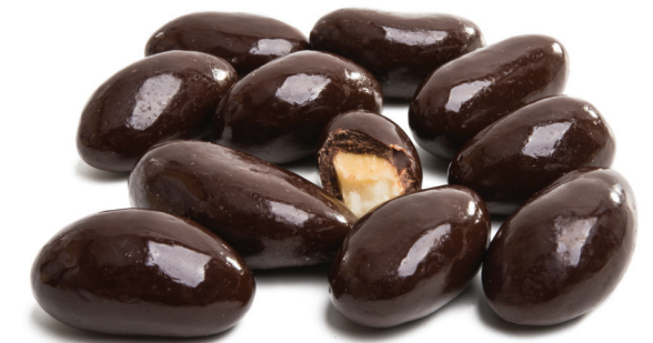
5401 DARK CHOCOLATE COVERED ALMONDS AMANDES ENROBÉES DE CHOCOLAT AU LAIT Roasted almonds coated in decadent dark chocolate.(140g bag) $10.00