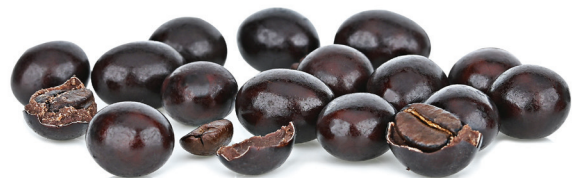
5404 DARK CHOCOLATE COFFEE BEANS/ GRAINS DE CAFÉ GOURMANDS ENROBÉS DE CHOCOLAT NOIR Crunchy coffee beans covered in luscious dark chocolate. (5oz 140g bag) $12.00