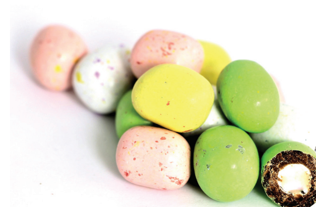
5421 GOURMET SPECKLED MARSHMALLOW EGGS The hunt won't last long when the Easter Bunny leaves these chocolate covered mini marshmallows coated with an assorted pastel candy sugar shell. Cello Bagged. (5oz 140 gr. bag) $12.00