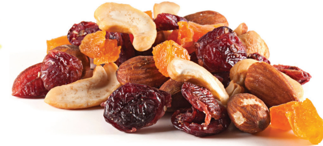
5421 SUMMER FRUIT AND NUT MIX Feeling tropical? The perfect mix of raisins, papayas, pineapples, almonds, cashews and cranberries. (140g bag) $10.00