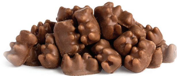
5504 GOURMET MILK CHOCOLATE COVERED GUMMY BEARS BONBONS GOURMANDS D'OURSONS EN GÉLATINE ENROBÉS DE CHOCOLAT AU LAIT Real Swedish gummy bears coated with an amazing milk chocolate. (120g bag) $12.00