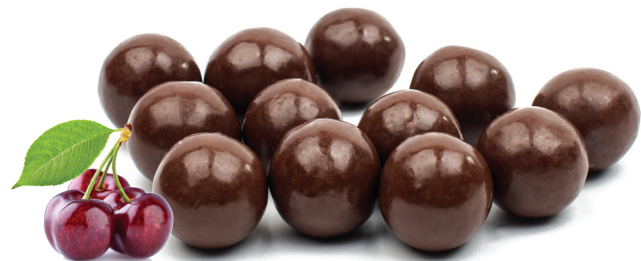
5403 DARK CHOCOLATE COVERED CHERRIES/ CERISES ENROBÉES DE CHOCOLAT NOIR Sweet dried cherries covered in luscious dark chocolate. (120g bag) $12.00