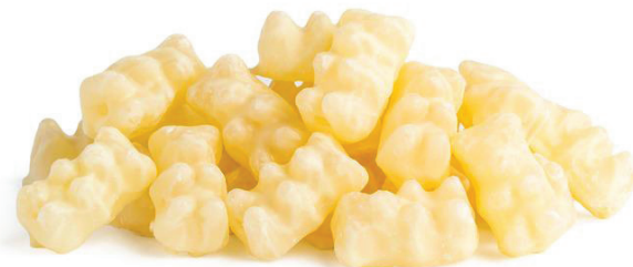
5505 GOURMET WHITE CHOCOLATE COVERED GUMMY BEARS These real Swedish gummy bears cozy up to a coat of cocoa butter-based white chocolate. (120g bag) $12.00