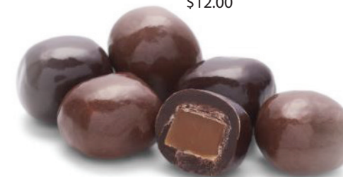
5238 MILK AND DARK SEA SALT CARAMELS Our milk & dark chocolate sea salt caramels are a mouthful of savory, sweet perfection. ( 120g bag) $12.00